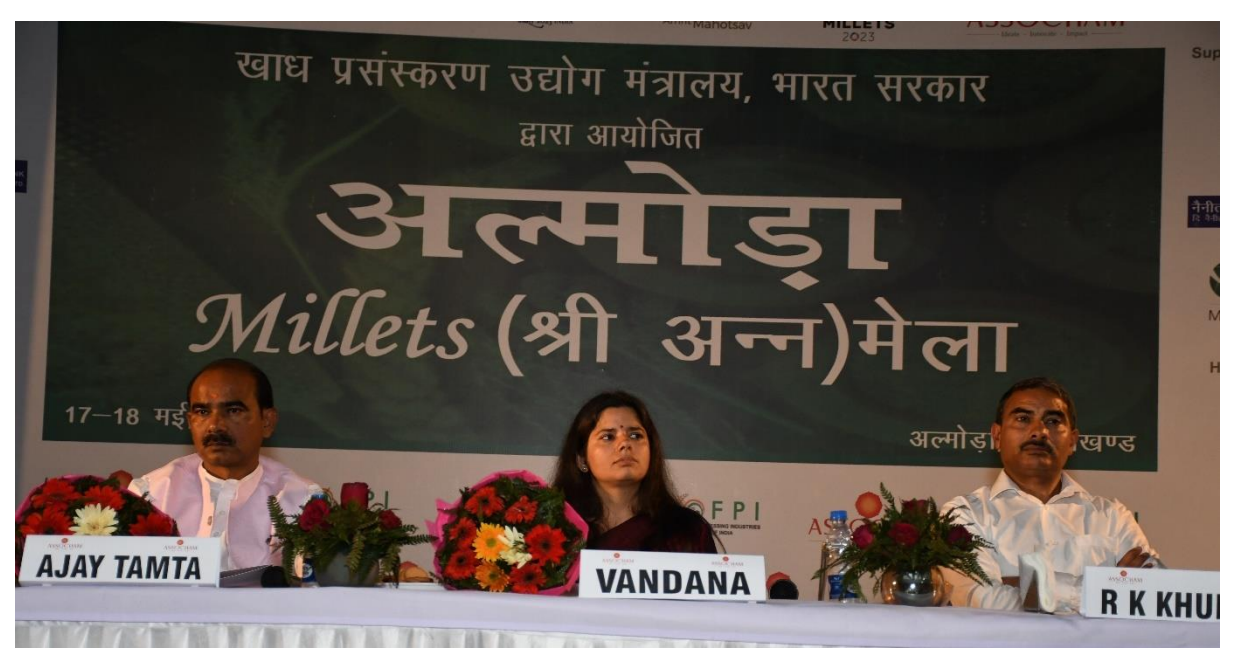
Mr. Ajay Tamta, Hon'ble Member of Parliament, Lok Sabha along with other dignitaries at the Inauguration Session

The main aim of the conference cum exhibition was to enthuse people for opting more Millet Based cropping systems; to promote Millet as a healthy alternative and enhance the infrastructure of Processing in the Almora region. The exhibitors demonstrated a wide range of millet-based processed food products with local crops grown in hilly areas. There was a footfall of around 1500 people on the two days of the conference cum exhibition.